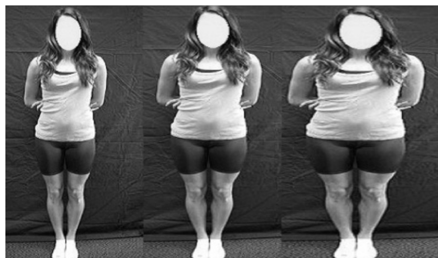
Figure 2. Body Form Imaging manipulated photographs (anonymous)