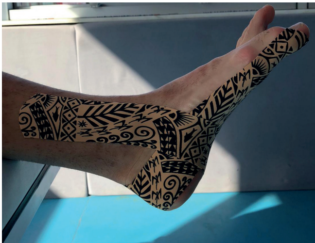
Figure 1. Dynamic tape arch support technique

In this study, the arch support technique was used with 5 cm × 5 m of Dynamic Tape®. The individuals were placed in the supine position. Forefoot adduction, calcaneal varus, and the big toe were placed in a flexion position. The taping was started from the proximal thumb, following the medial plantar surface of the foot, the tape was looped around the calcaneus, passed through the sole of the foot, pulled upwards to the navicular, and the navicular was raised. The dynamic taping technique is shown in Figure 1. After taping, the 1st MTP joint should be in flexion, the calcaneum inverted, and the metatarsals should be convex on the dorsum of the foot. If these changes are not present in non-weight bearing, the technique is unlikely to apply a genuine force into the system so it cannot affect foot biomechanics [16].