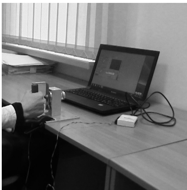
Figure 1. Testing station for range of movement assessment – goniometer

The participants did not have any opportunity to familiarize themselves with the appliance prior to testing. Each participant performed two tasks in each series. Blindfolded, they were asked to execute a pronation and supination movement with the dominant limb three times (standard movement), from the so-called neutral position (zero angle) and to the angle of 45 degrees. Upon reaching the 45 degree angle a loud buzzer was automatically activated. Immediately after that, the participants repeated the same movement five times, but this time from memory (blindfolded with no audio cue). Then, they performed same tasks with the non-dominant arm. The computer software recorded the maximum range of movement in each direction as the angle was attempted to be reproduced by the subject. The researchers controlled and adjusted