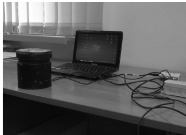
Figure 2. Testing station for assessment of reproduction of hand pressure force – dynamometer

The dynamometer used to evaluate the so-called force components of kinesthetic differentiation enabled the researchers to determine the precision of reproduction of hand pressure force (Figure 2).